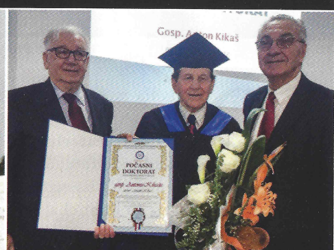
Honorary Doctorate from Herzegovina University.

plane. A professional British arms dealer arranged the military cargo. He was enroute to deliver the weapons, which Croatia desperately needed to defend itself from the aggression, but was forced to land in Zagreb, the capital, where the Yugoslav army captured him.