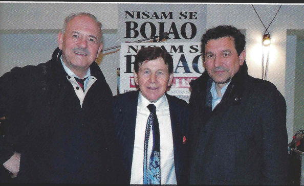
Frankfurt, Germany, with Consul General of Croatia and a friend.